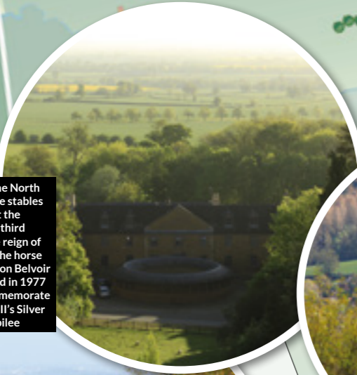
This view from the North Terrace shows the stables that were built at the same time as the third Castle during the reign of King Charles II. The horse chestnut avenue on Belvoir Road, was planted in 1977 and 2012 to commemorate Queen Elizabeth II's Silver and Diamond Jubilee