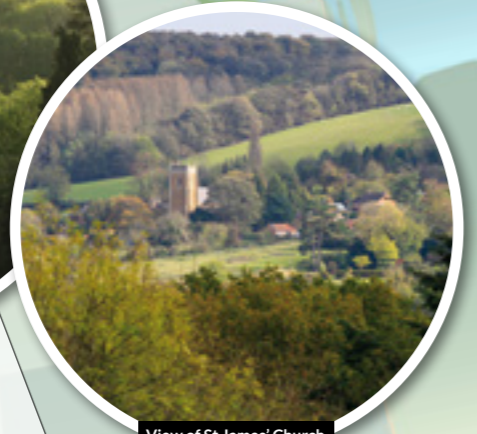
View of St James' Church in Woolsthorpe village