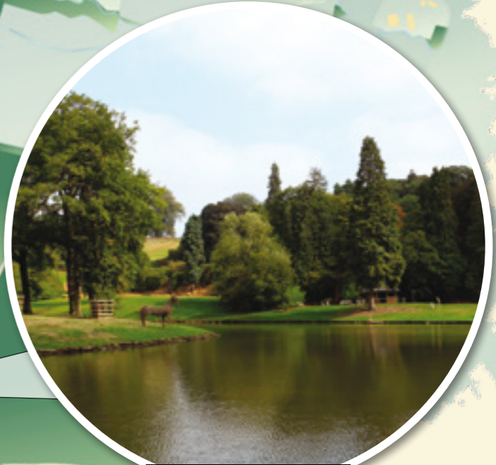
Frog Hollow was restored in 2013/14 in Capability Brown style

CONTACT INFORMATION General Enquiries: 01476 871 001 Wedding Enquiries: 01476 871 031 Conference Enquiries: 01476 871 031 Fishing Enquiries: 01476 870 647 Country Pursuits: 01476 871 004