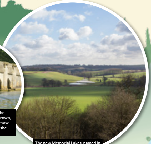
The new Memorial Lakes, named in memory of Duchess Elizabeth and Estate staff killed in action during World War Two, were restored between 2013 and 2015